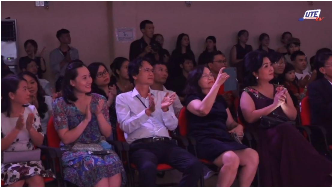
View at the hall

Summer is time to end the school year, also to complete the first collection for the students of fashion design programme enrolled in 2015 at HCMC University of Technology and Education as well as finish their learning process. In the waiting time for the graduation show at the main hall on July 21, 2019 with a crowded and bustling atmosphere, an expected number of 150 guests were constantly increasing which organizational board had to add and adjust the seats appropriate to the viewing angle.