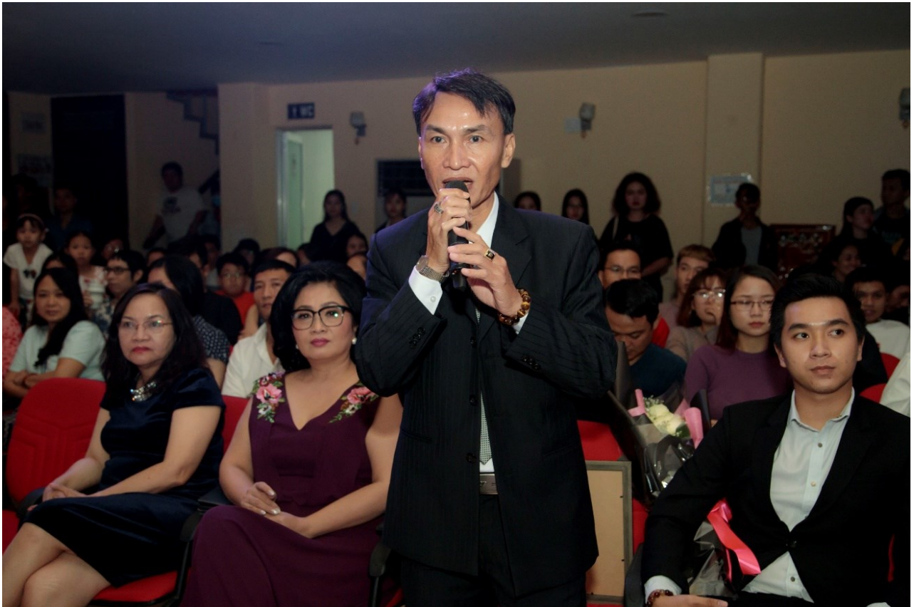
Representative from Nguyen Dung company