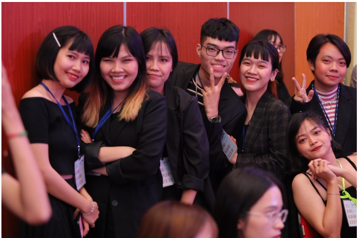
Students of 16123